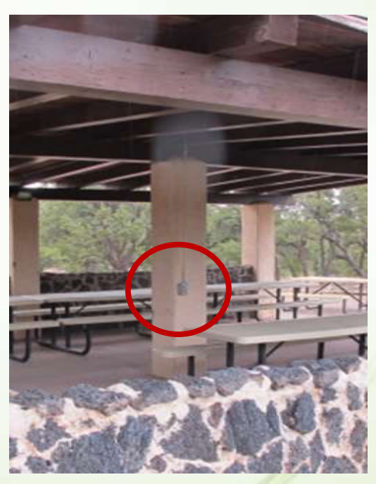
Electrical outlets, lights, BBQ pits